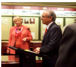
M Ganapathi, Consul General of India