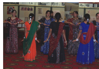
Performance by NRITYA dance group, sponsored by Bhavan Australia